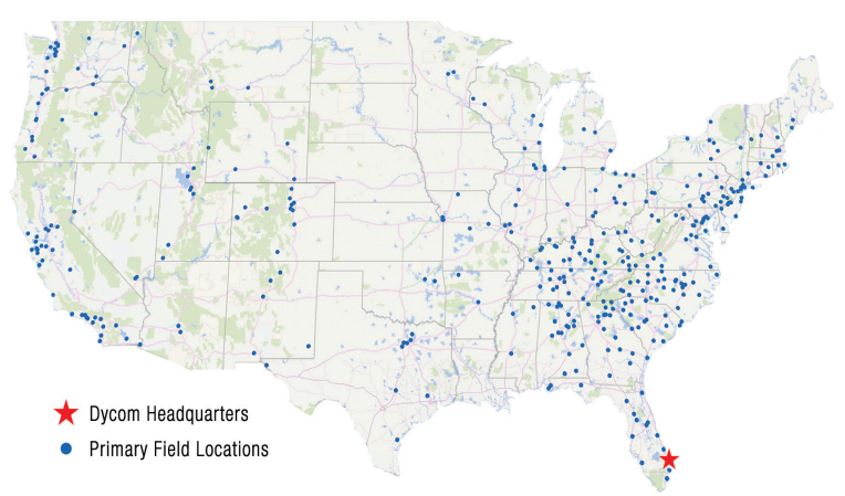
Dycom's Nationwide Presence

Dycom also performs construction and maintenance services for electric and gas utilities and other customers. In addition, Dycom provides underground facility locating services to a variety of utility companies, including telecommunication providers. Dycom's underground facility locating services include locating telephone, cable television, power, water, sewer, and gas lines.