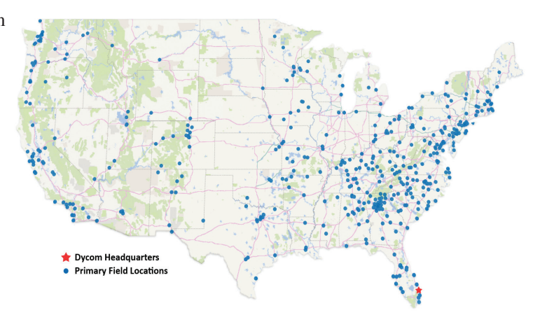
Dycom's Nationwide Presence

Dycom also performs construction and maintenance services for electric and gas utilities and other customers. In addition, Dycom provides underground facility locating services to a variety of utility companies, including telecommunication providers. Dycom's underground facility locating services include locating telephone, cable television, power, water, sewer, and gas lines.